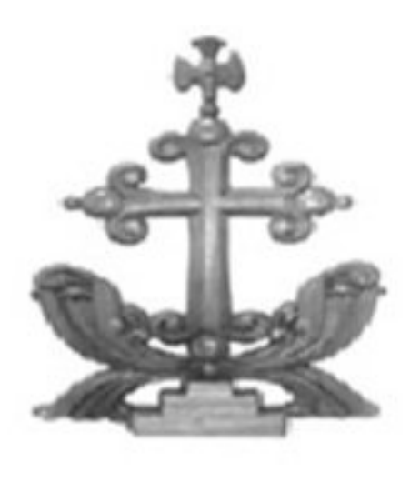
Compiled By St. Gregorios Indian Orthodox Church Mississauga, Ontario, Canada.